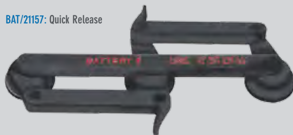
BAT/21157: Quick Release

use the automatic water filling system. Reference list on demand.